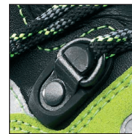
HAIX® 2-Zone Lacing