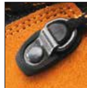
HAIX® 2-Zone Lacing