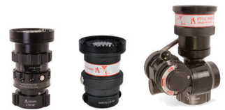
Style 4446 Nozzle