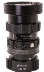
Style 4446 Nozzle